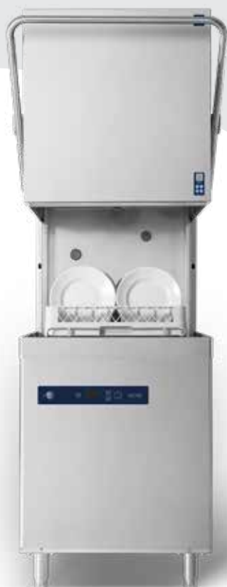
D2 Core hood-type dishwasher

The Water-Smart range delivers top wash results that complies with the EN 17735:2023 hygiene norms.