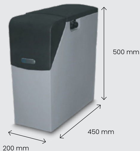
Art. number: 28145