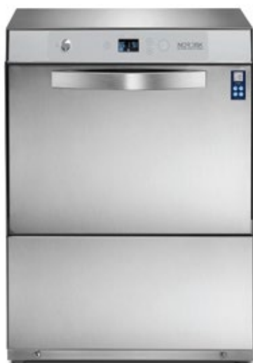
G0 Core compact glasswasher Art.no. 31156

Instant access to information Scan the QR code for online access to servicing history, user and service manuals or troubleshooting guides. That's SIMpel™!